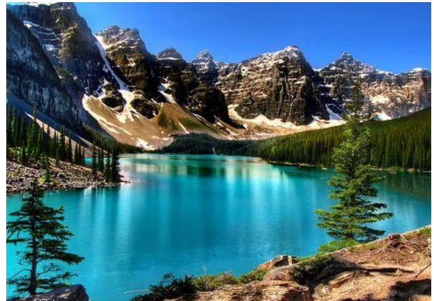
Banff National Park