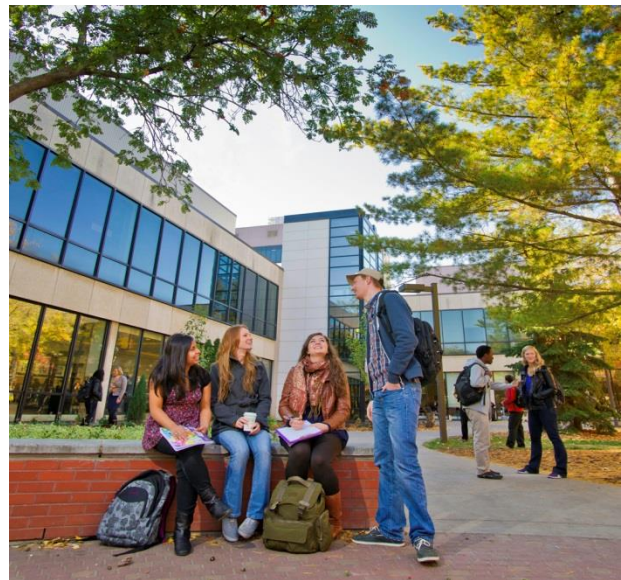
Students on campus