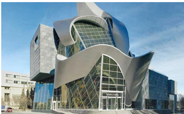
Art Gallery of Alberta