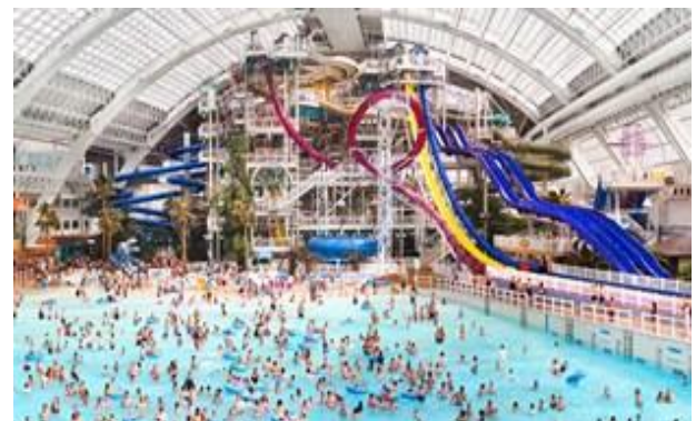
West Edmonton – Indoor water park