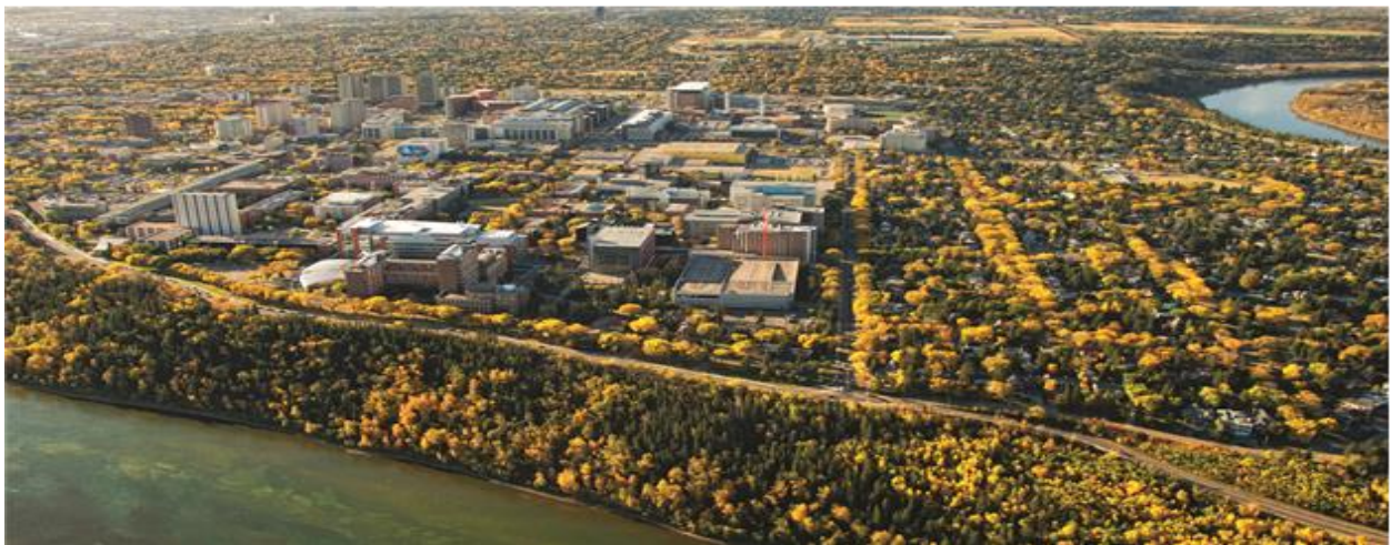
University of Alberta North Campus