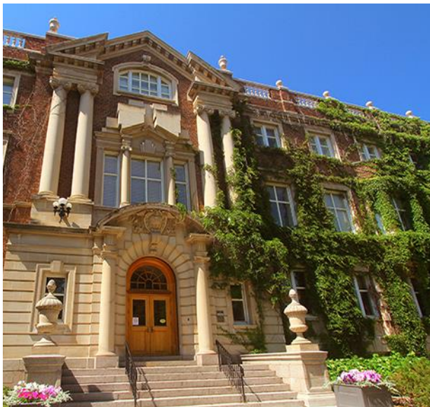
Arts and Convocation Hall

The program will allow students to apply their learning by working on a presentation which will be delivered by the end of the two weeks.