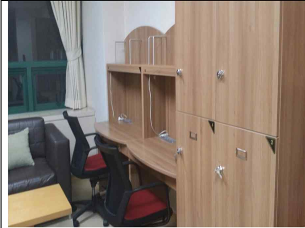
Desk, chair and locker