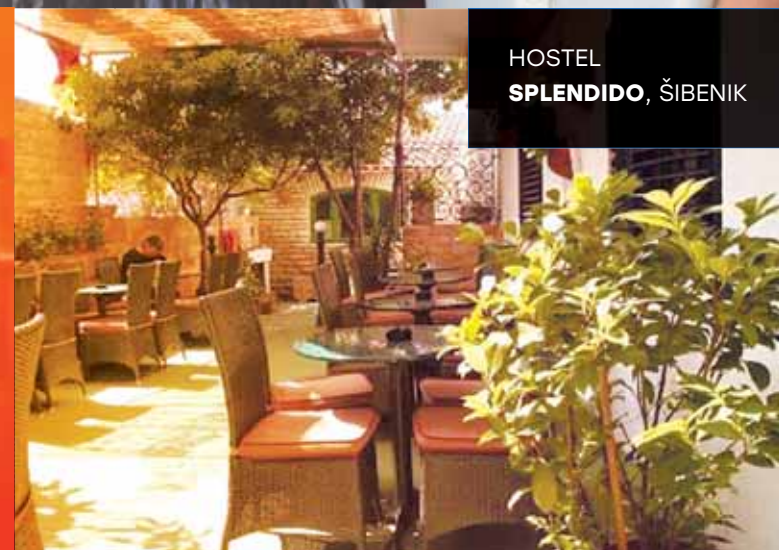
HOSTEL SPLENDIDO , ŠIBENIK